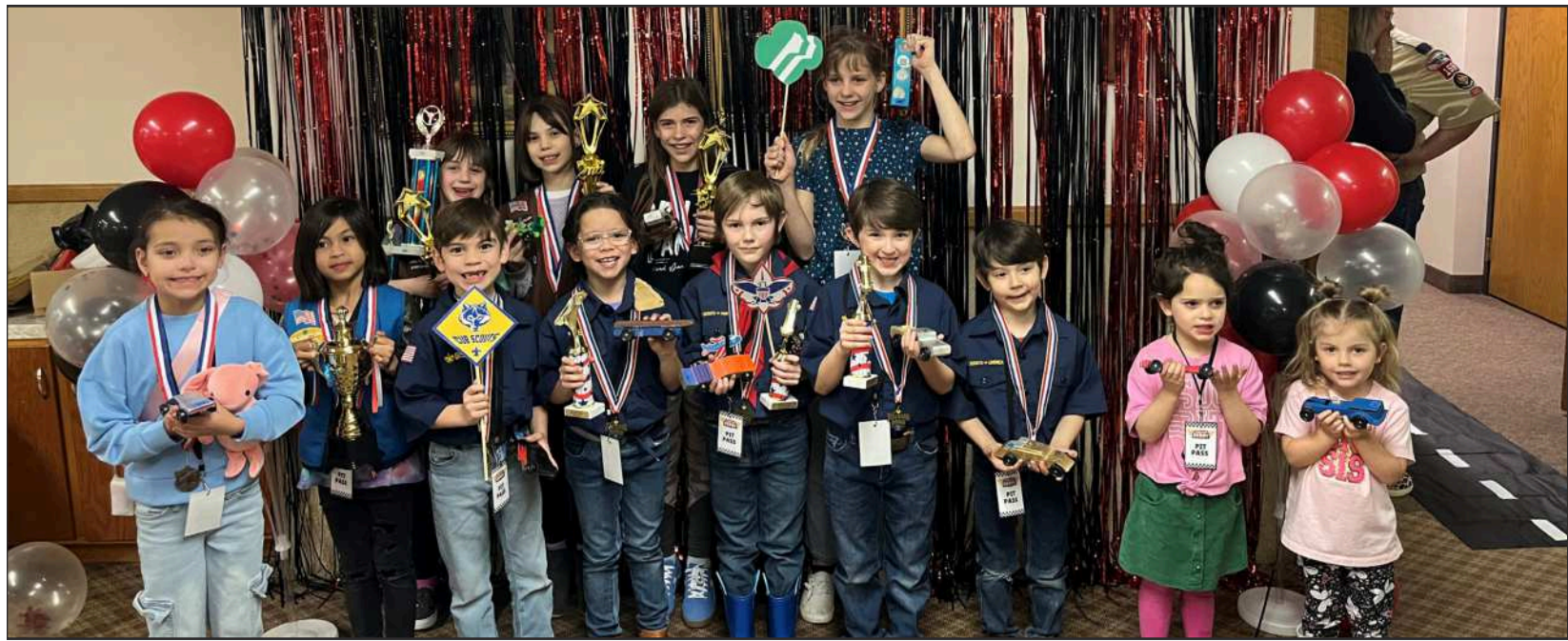
Albion’s Cub, Pack and Girl Scout troops had members participate, including an open class.