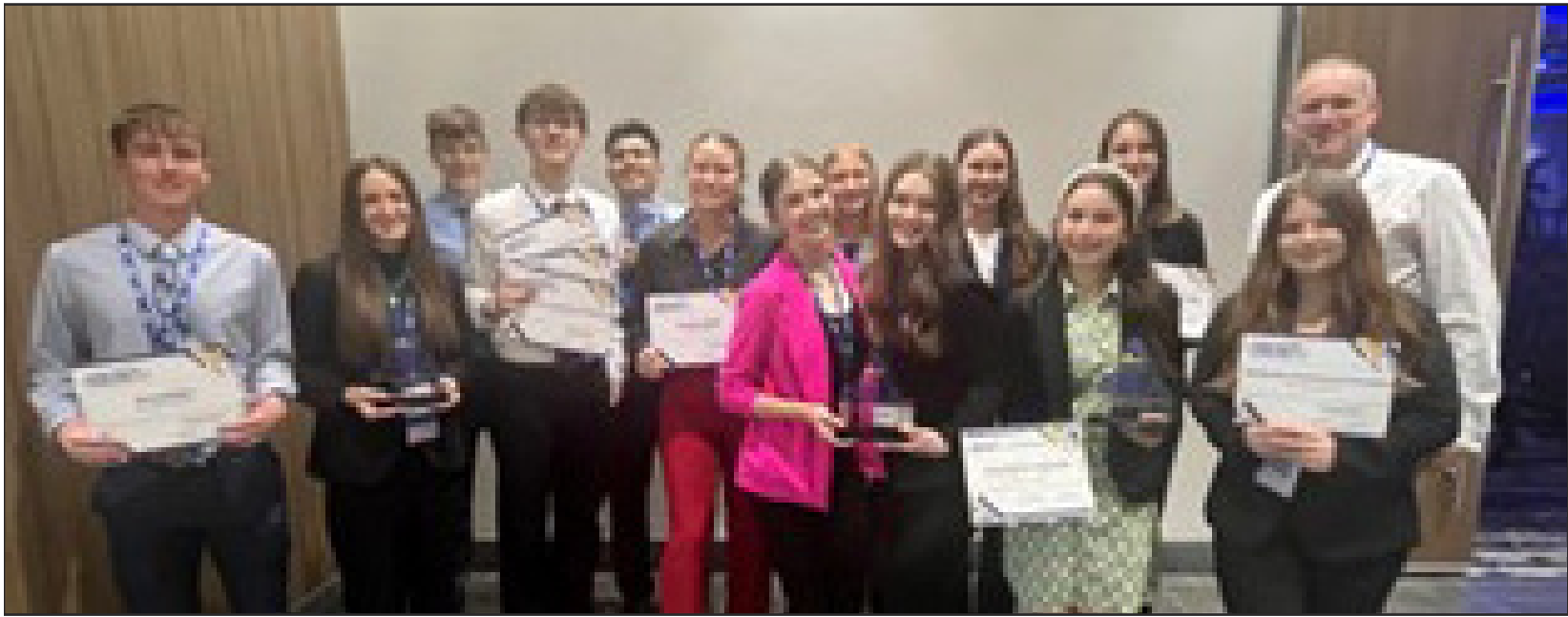
The Cardinal FBLA teammates with their awards.