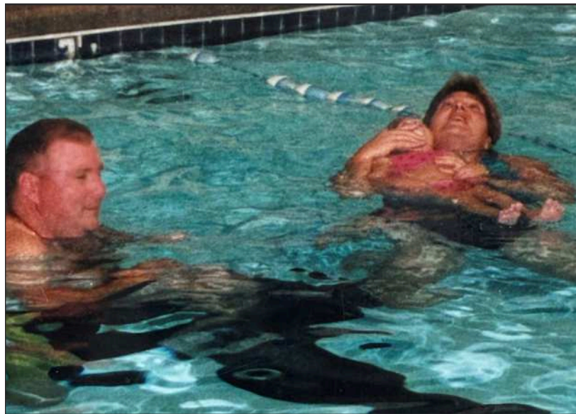
Youth of all ages come to the Center for swimming lessons.